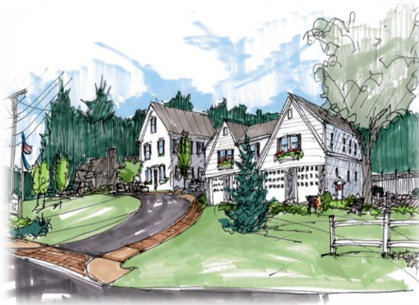
Proposed Street Elevation – Town Hall/Planning

The Windham Town Common Beautification Committee (TCBC) was formed at the request of the Board of Selectman to look at options and alternatives to enhance and beautify Windham’s Town Center. The project includes the areas around, Town Hall, the Armstrong Building, the Community Development Building, the Town Pound, the Veteran’s Memorial, and the common area behind the Senior Center and the Bartley Building. The drawings represented here show the conceptual plans developed for this project as well as the construction plans for Phase One.