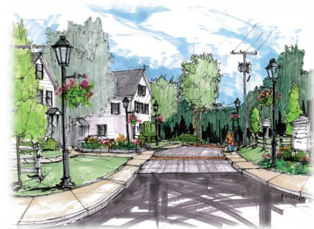
Proposed Street Elevation – North Lowell