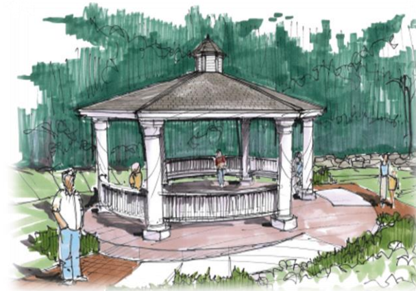
Proposed Gazebo Reconstruction – Bartley/Senior Center