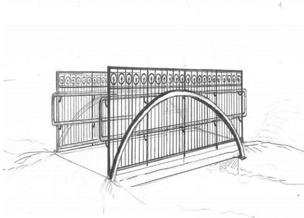
Artist Rendering of New Bridge