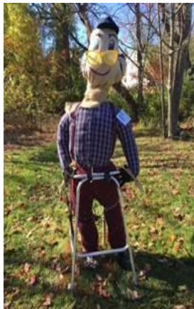
One of last years Contestants!

HARVEST FEST AT GRIFFIN PARK October 19 th 12-4